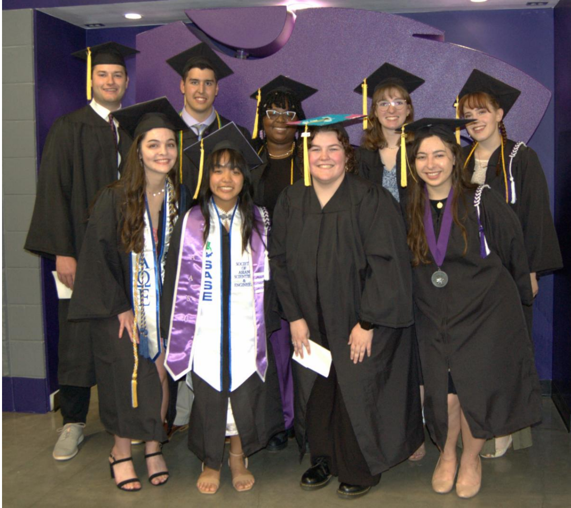
Bakery Science and Industry