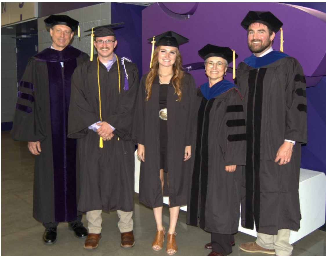
Feed Science and Industry