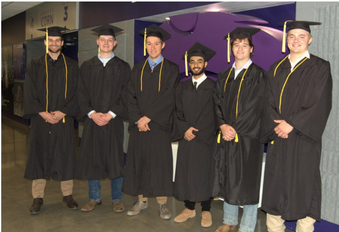
Milling Science and Industry