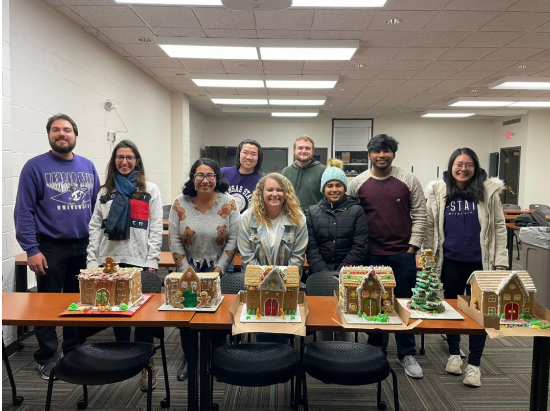
The Grain Science Graduate Student Organization enjoyed making gingerbread creations at their November Social.