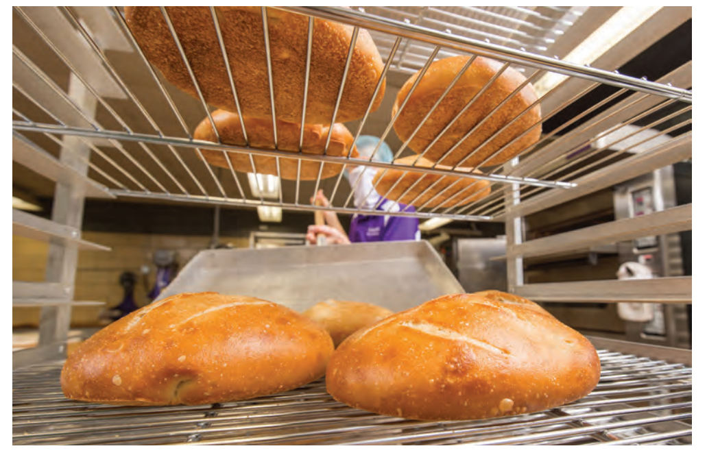
Clanton loads sourdough bread onto cooling racks at K-State.

giving fresh flour, which is fresh food for the microorganism, and that kind of rejuvenates it."